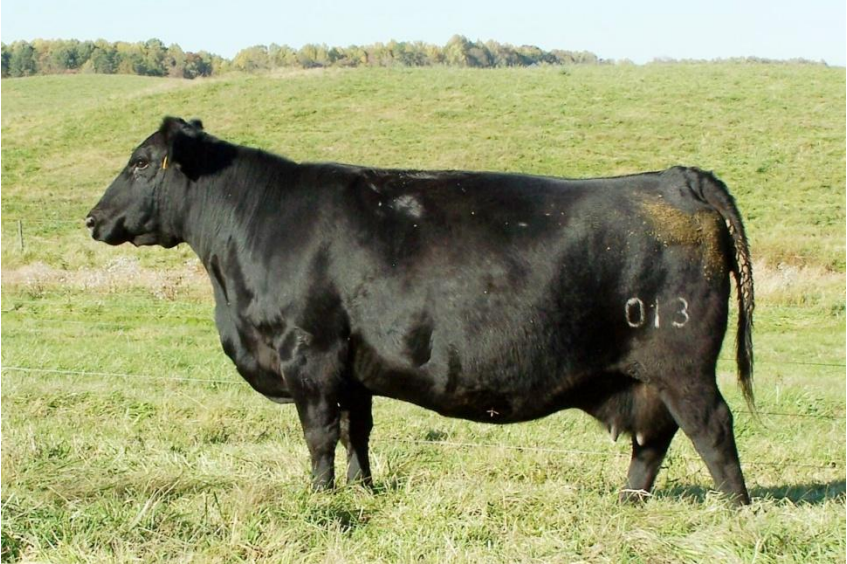
Mystic Hill Elba 013 – Dam of 5T25, heavy with calf