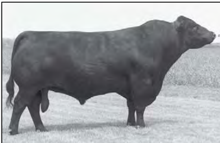
Reference Sire F