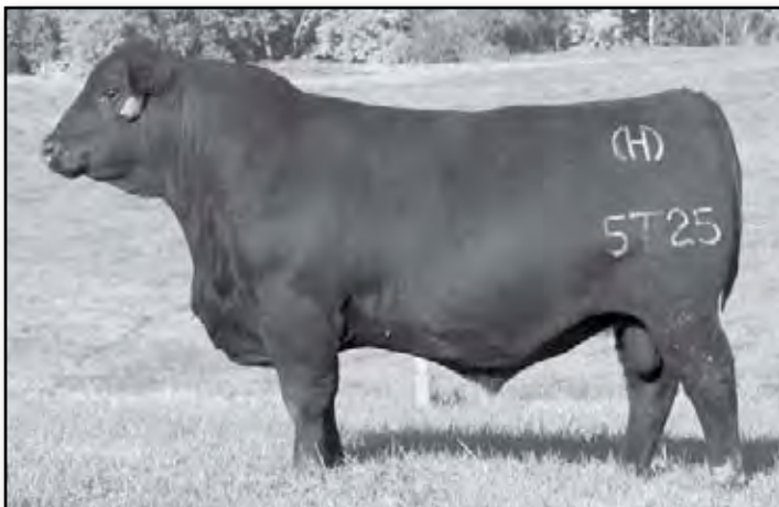
Mystic Hill Right Time 5T25 - Sire of Lot 24