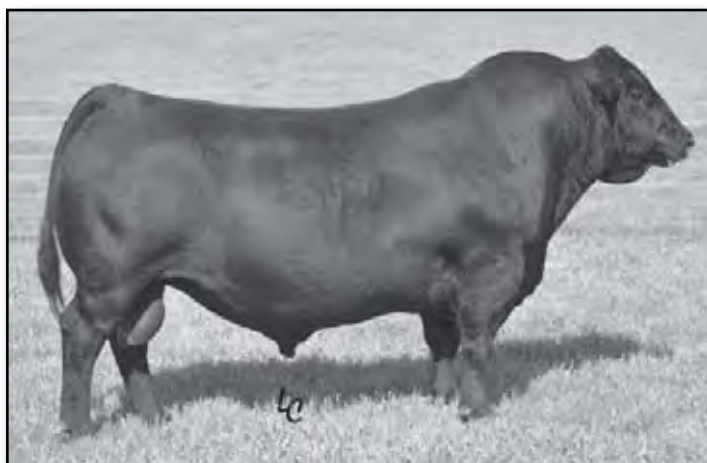
Reference Sire B