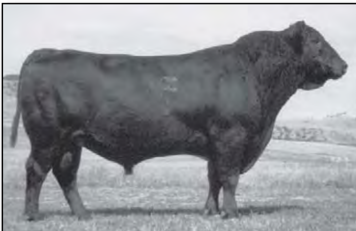
Reference Sire A