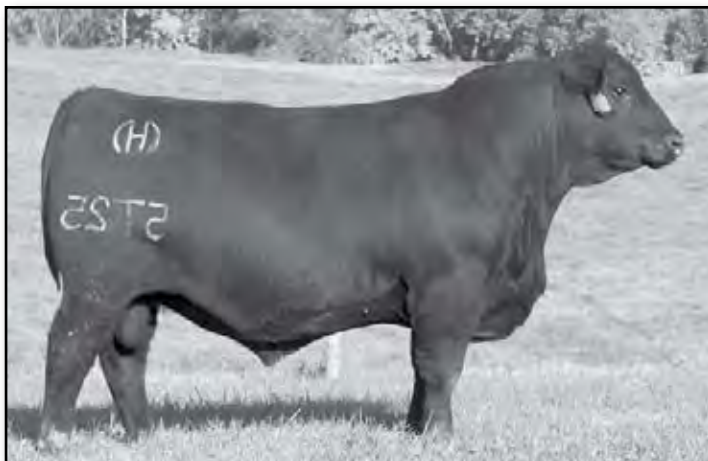
Reference Sire C