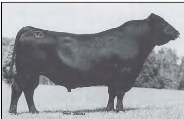
Reference Sire E